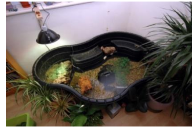
Ideal Housing/Enclosure Setups for Diamondback Terrapins and Other Aquatic Turtles.